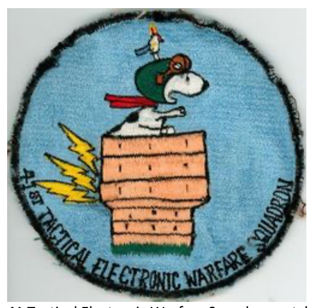
41 Tactical Electronic Warfare Squadron patch

1 Observation Squadron emblem: Three black chain links forming an equilateral triangle enclosing a blue background charged with a rising sun in gold. (Approved, 3 Jan 1933)