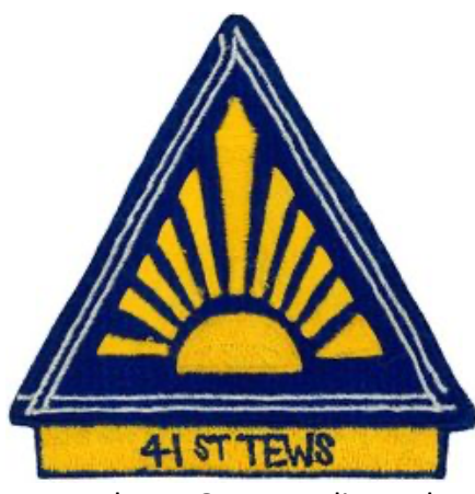
41 Tactical Electronic Warfare Squadron patches: On a Medium Blue disc edged Black a Blue equilateral triangle charged with a Yellow demi-sun emitting thirteen rays, all within a Black band formed by three chain links highlighted White.